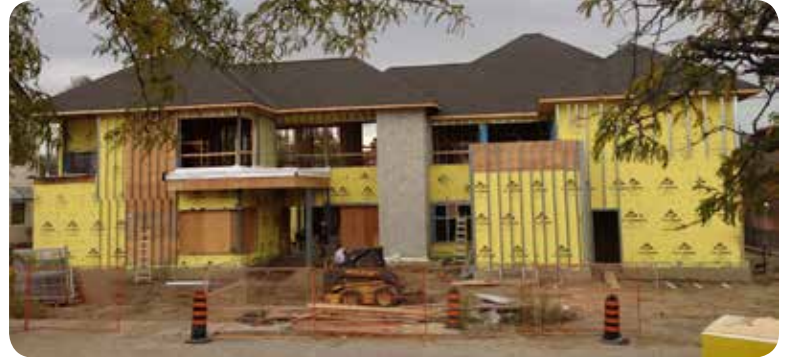
View of the front of the Hospice

Construction updates and pictures can be found on our website www.chathamkenthospice.com and Facebook page.